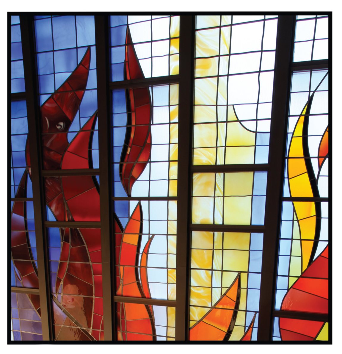
"Open for us the Gates of Righteousness"

TEMPLE ISRAEL CONGREGATION YAD B'YAD-HAND IN HAND